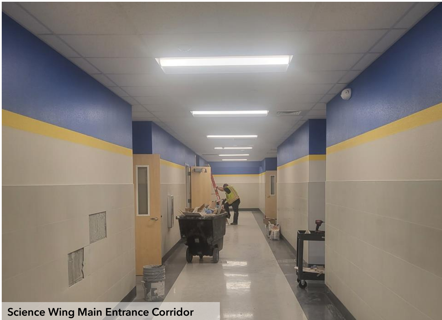
Science Wing Main Entrance Corridor