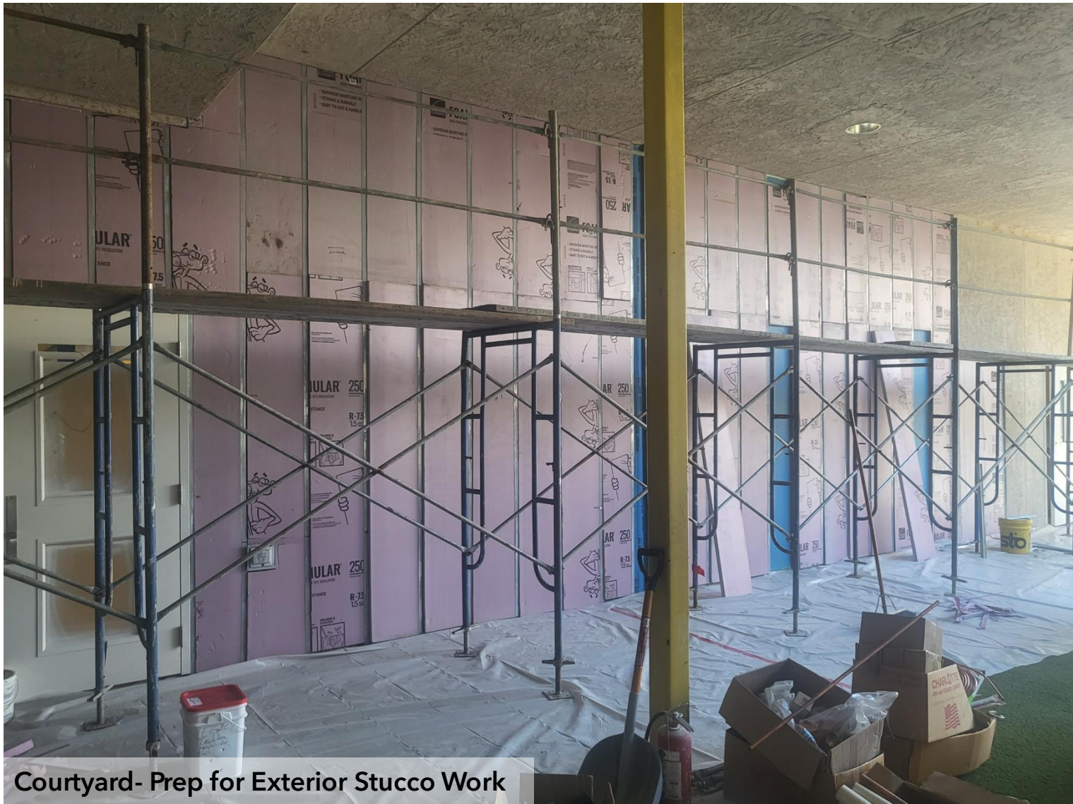
Courtyard- Prep for Exterior Stucco Work